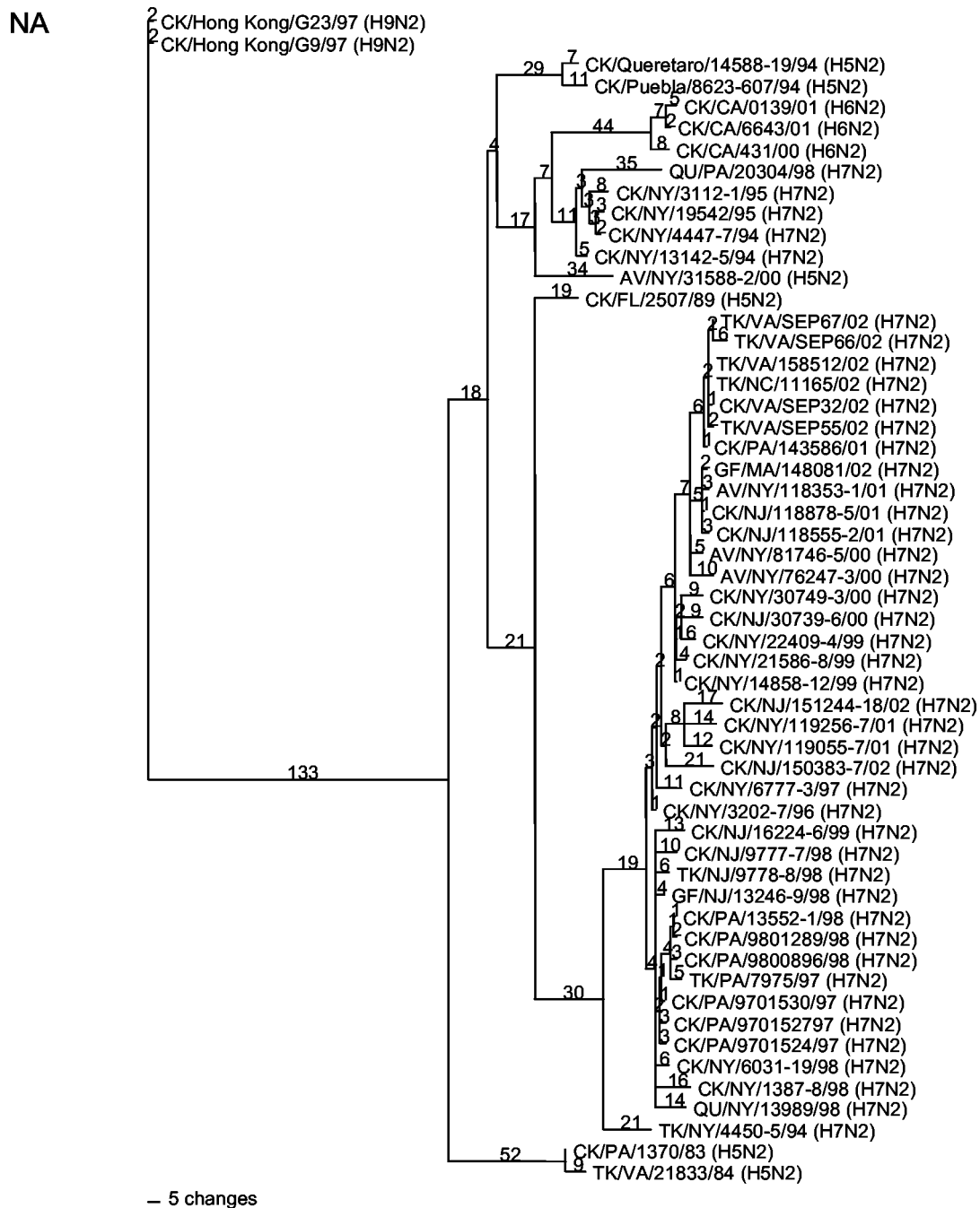
FIG. 2. Phylogenetic tree of the NA (subtype N2) gene of AIVs isolated in North America (with subtypes noted on the tree). Groupings of H7N2 viruses isolated in the northeastern United States between 1994 and 2002 are shown. The tree was generated by the maximum parsimony method with PAUP 4.0b10 (heuristic search and 500 bootstrap replicates) and is not rooted. AV, avian; CK, chicken; GF, guinea fowl; QU, quail; TK, turkey. The names of the states where the viruses were isolated are represented by their standard two-letter postal codes.

binding affinity arising from increased glycosylation near the receptor binding site (11, 19). The presence of an eight-amino-acid deletion in a region of the HA1 segment that putatively corresponds to the receptor binding site (based on the structure of the H3 HA gene) (20) has been reported only in this lineage (17, 18) and may represent a novel compensatory mutation for the NA stalk deletion. The impact this deletion may have on HA binding needs to be investigated further. Interest-